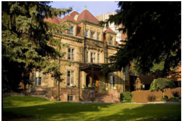
McGill University, Faculty of Law Montréal, Qc, Canada H3A 1W9 Website: www.mcgill.ca/iasl