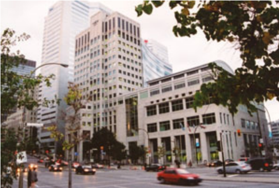
International Civil Aviation Organization 999 University Street, Montréal, Qc., Canada, H3A 2R2 Website: www.icao.int