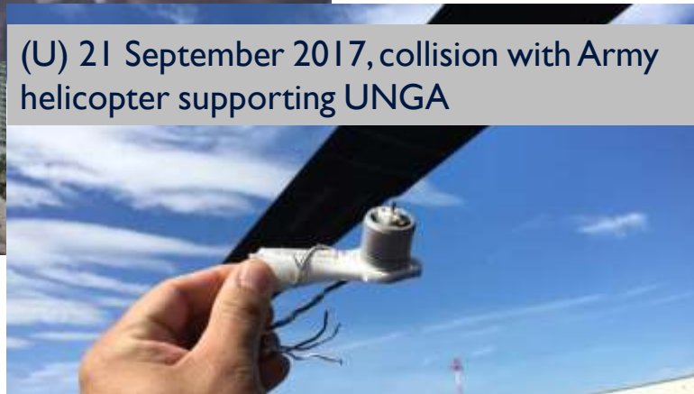
(U) 21 September 2017, collision with Army helicopter supporting UNGA