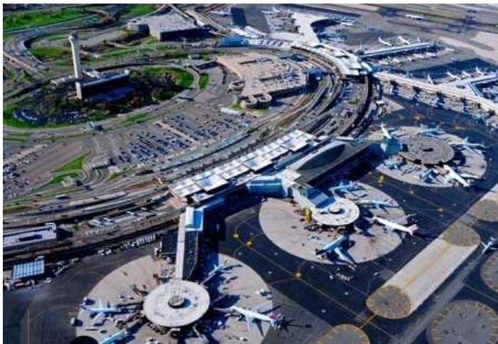
(U) Newark International Airport; 22 Jan 2019