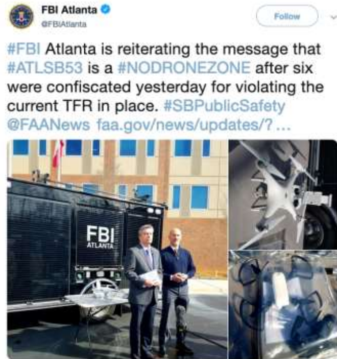
8:48 AM - 1 Feb 2019 (U) Super Bowl 53; January-February 2019