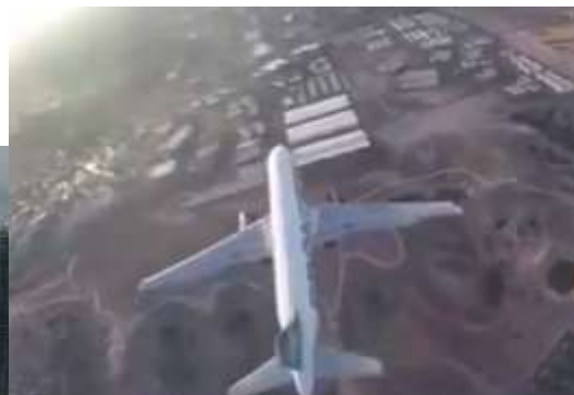
(U) Early 2018, Video posted of UAS near commercial aircraft on approach into Las Vegas