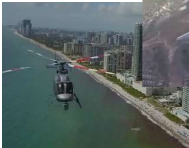
(U) August 2018, UAS near helicopter in Hollywood, FL