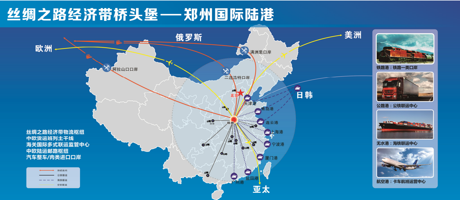
Zhengzhou International Inland Port