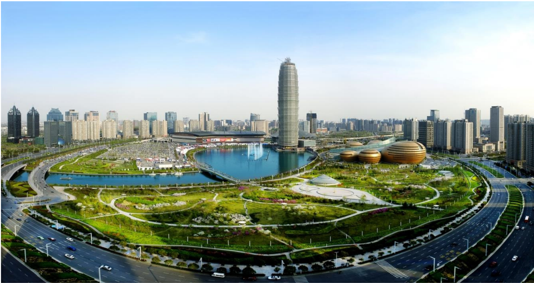
CBD in Zhengdong New District