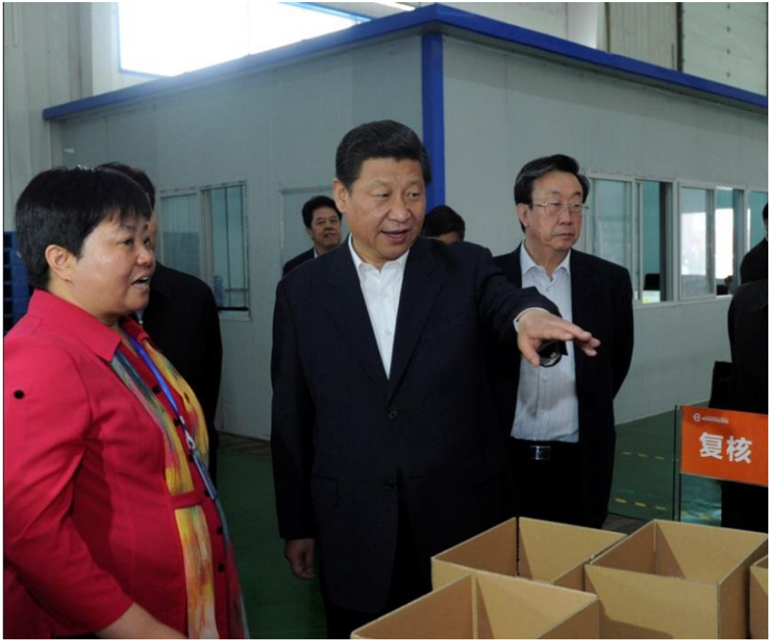
Xi Jinping has a site visiting to know the goods distribution and inspection at Henan Bonded Logistics Center