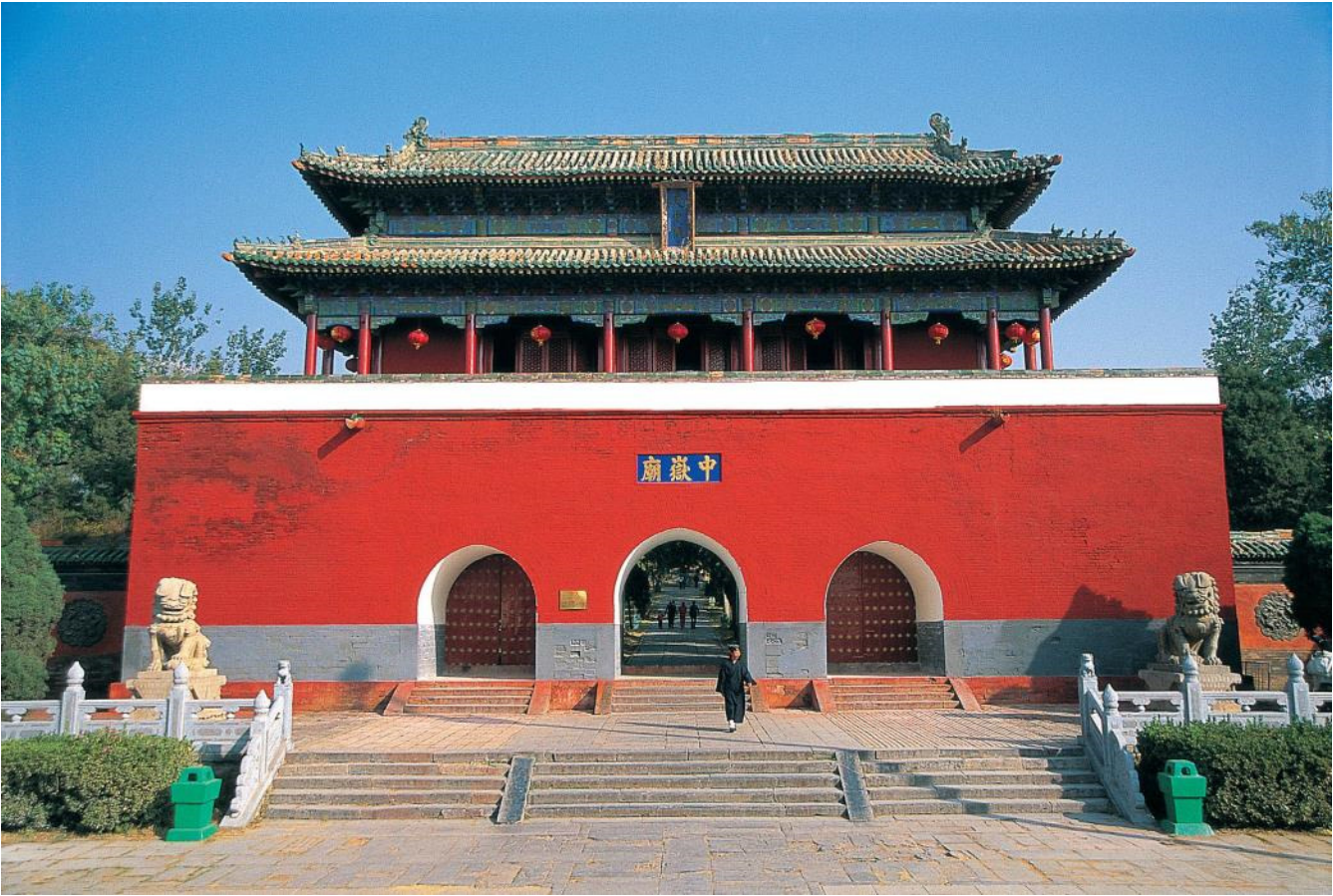
Tianzhong Pavilion in Zhongyue Temple