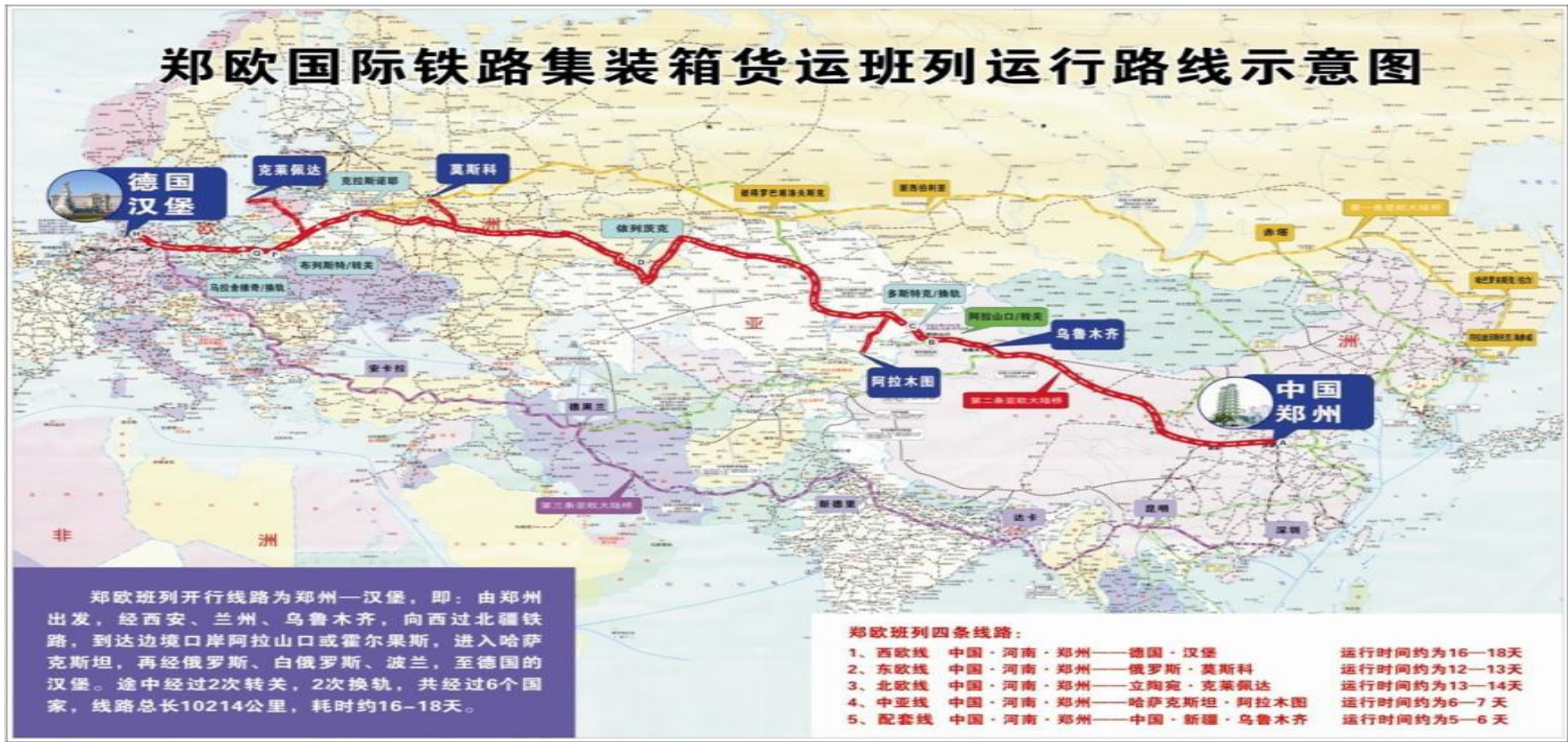
Zhengzhou-Europe International Block Train