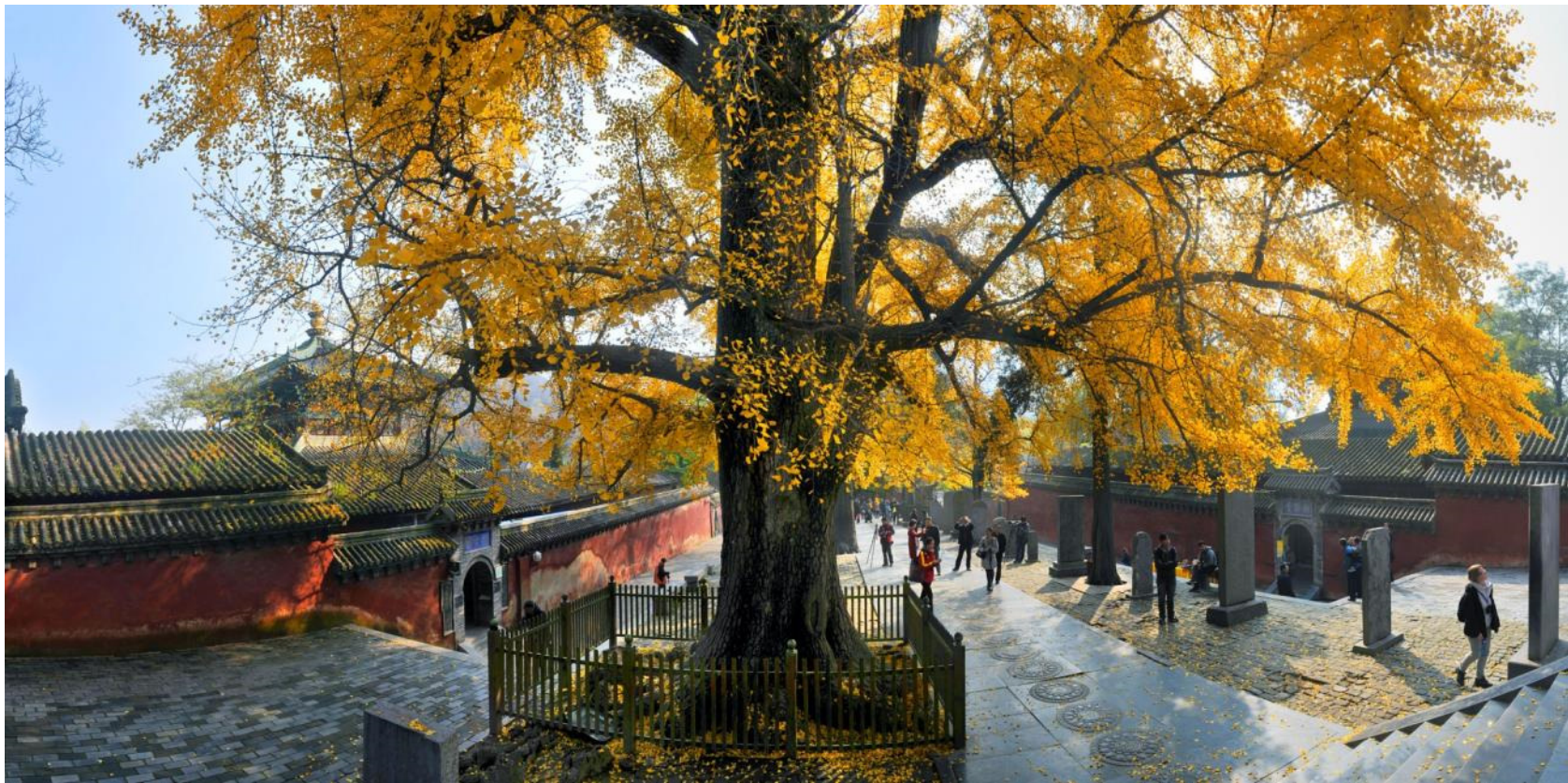
Ginkgo Tree with Thousand Years in Shaolin Temple