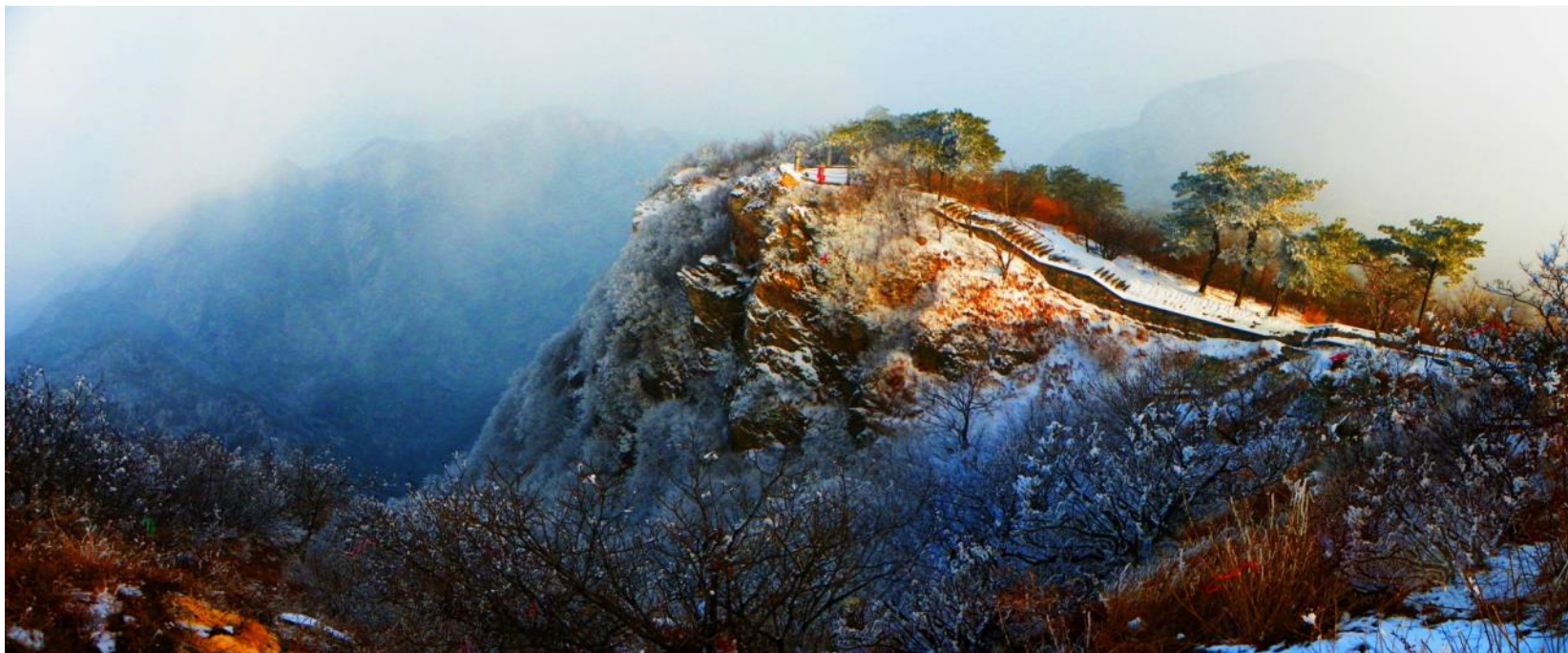
Snowing Picture of Songshan Mountain