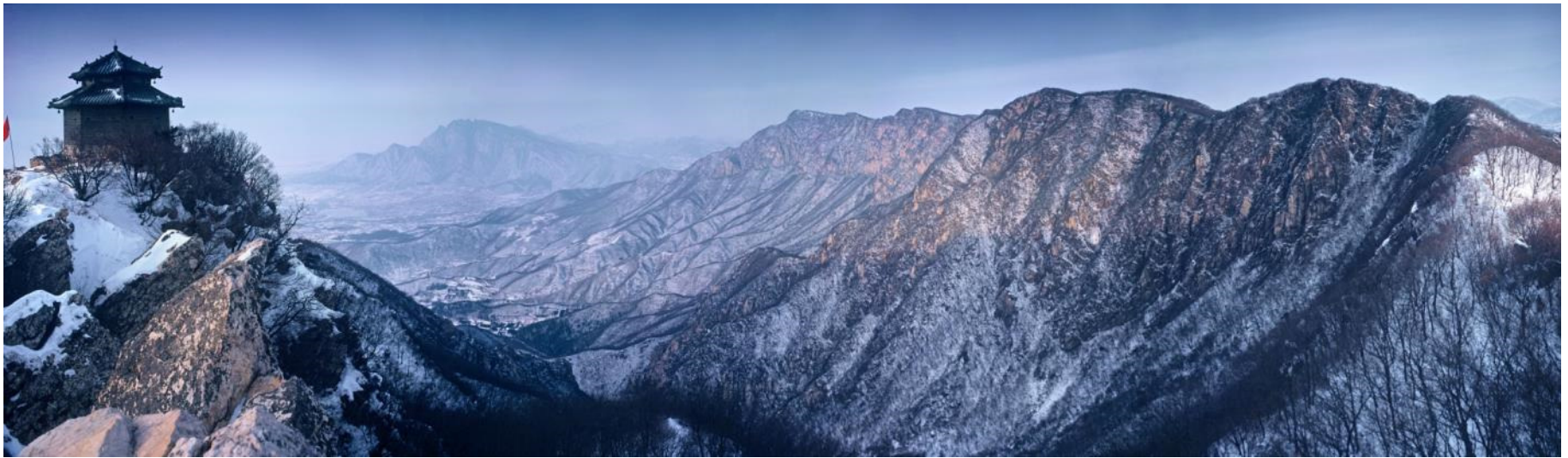
Top of Songshan Mountain