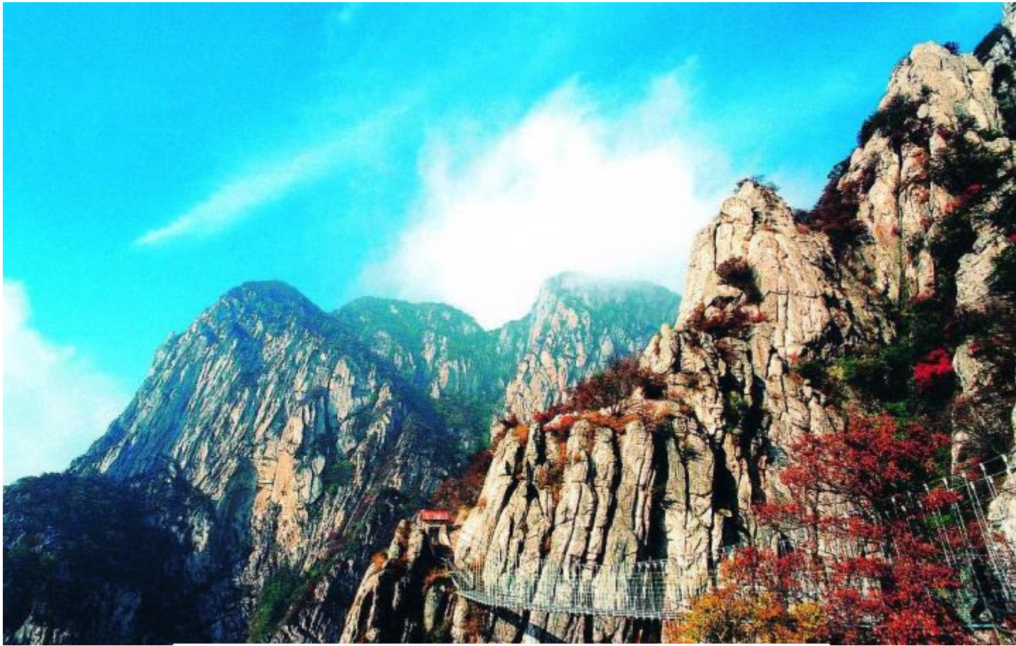
Picture of Songshan Mountain in Autum