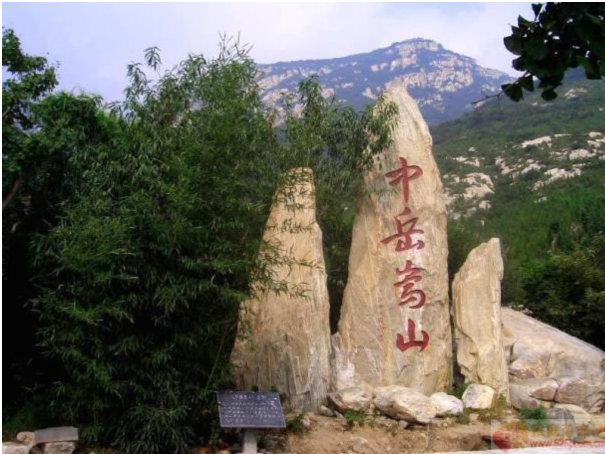
Zhongyue Songshan Mountain