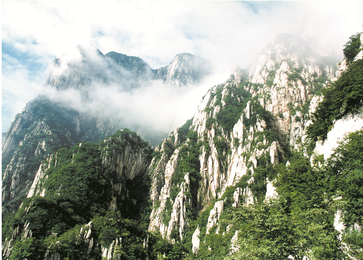
Picture of Songshan Mountain