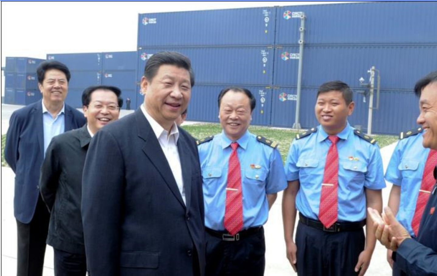
President Xi is talking with the crew members of Zhengzhou-Europe International Block Train at the Zhengzhou Internaitonal Inland Port