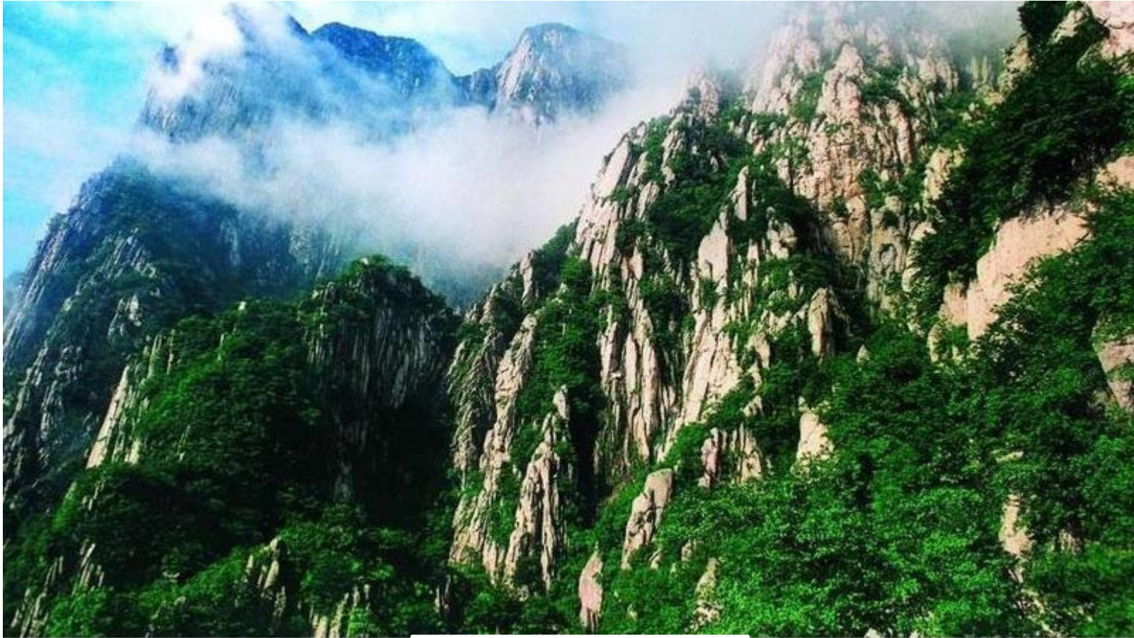
Picture of Songshan Mountain