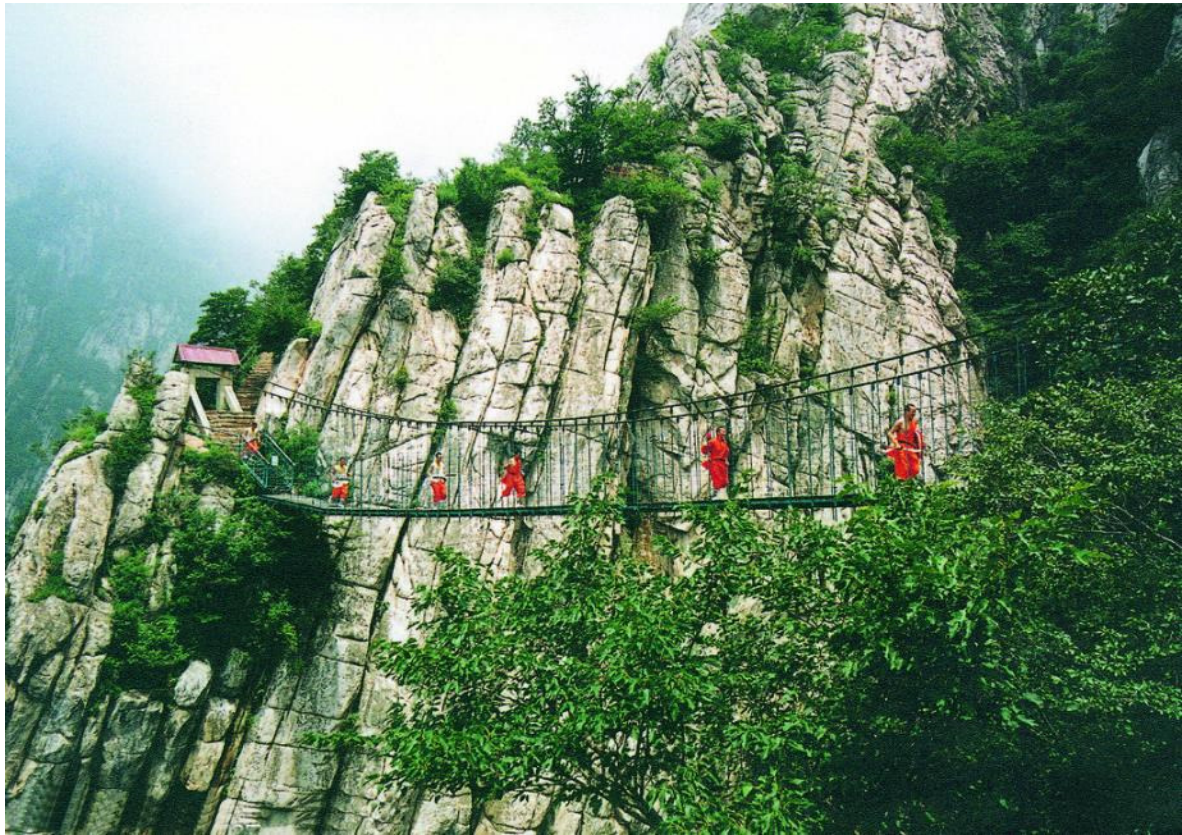
Picture of Songshan Mountain