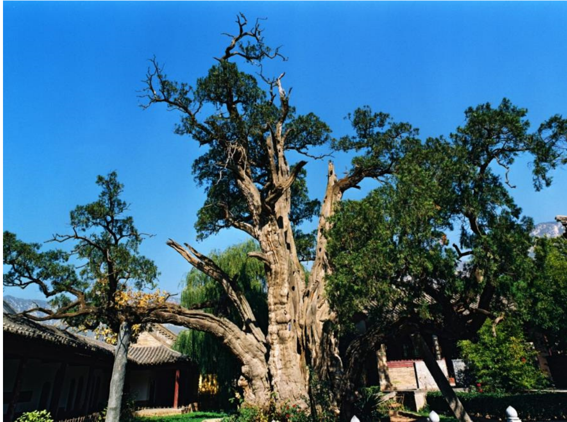
General Cypress in Songyang Academy