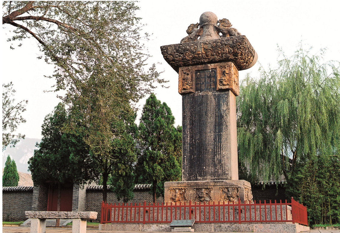
A stela erected in 744AD recording a Daoist Monk experimenting elixir fomulas for then-emperor Tianbao of the Tang Dynasty