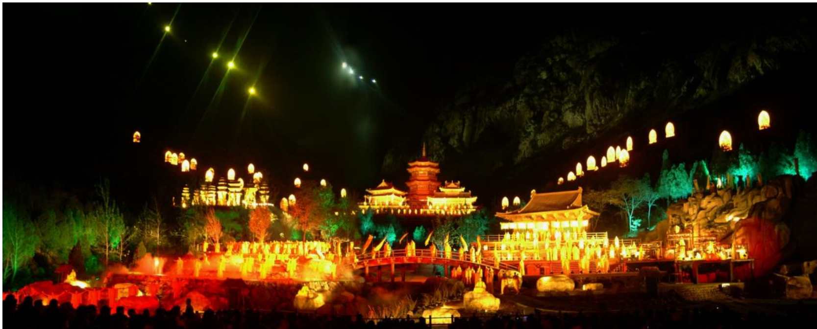
Zen Music Shaolin Grand Ceremony