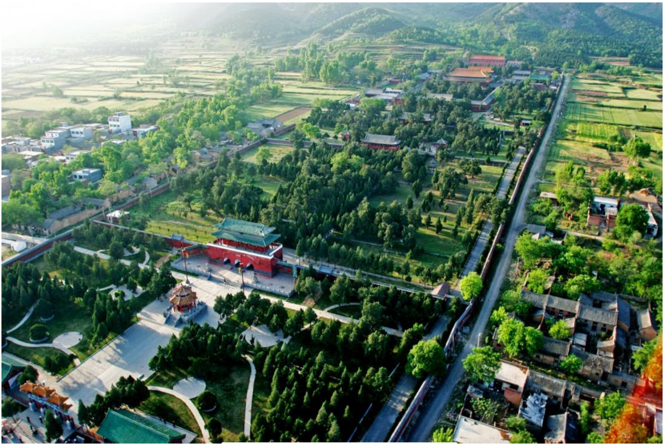
Panorama of Zhongyue Temple