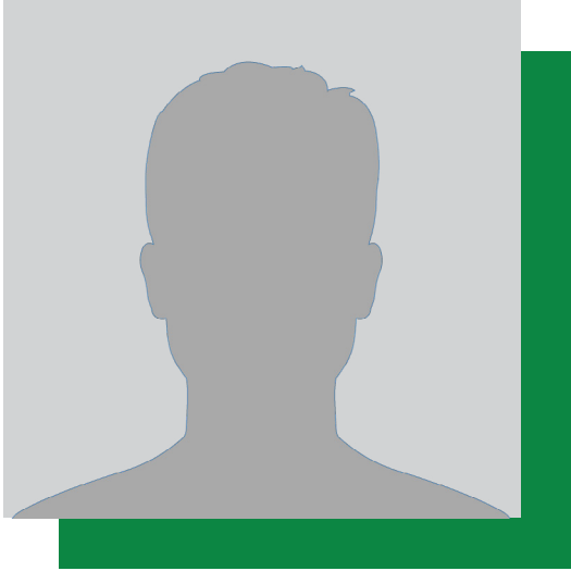
Borge Brende President, World Economic Forum