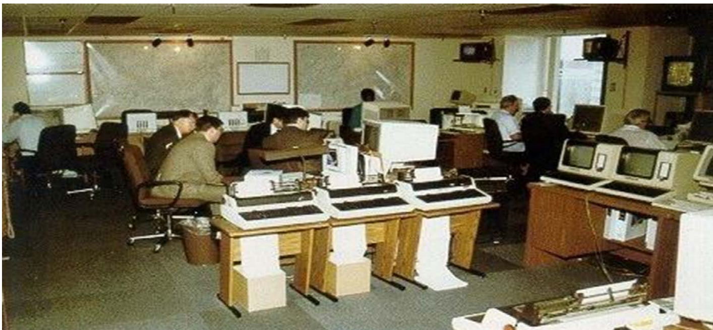
Original ATCSCC in HQ 1970's