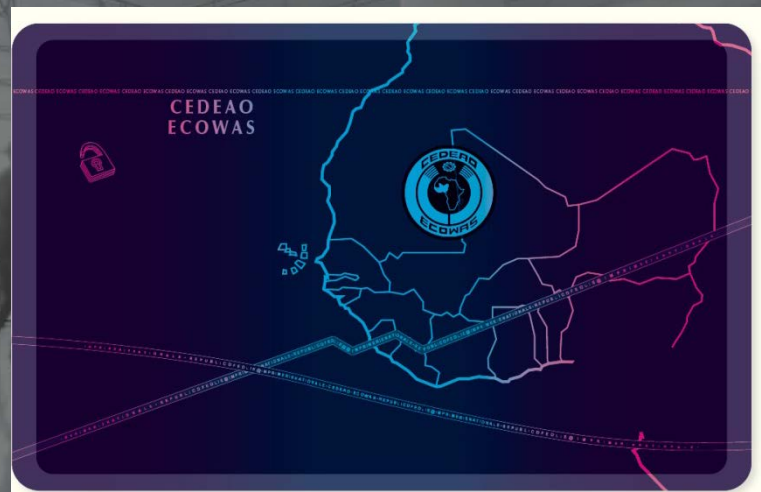
► Recto Uv-irisation