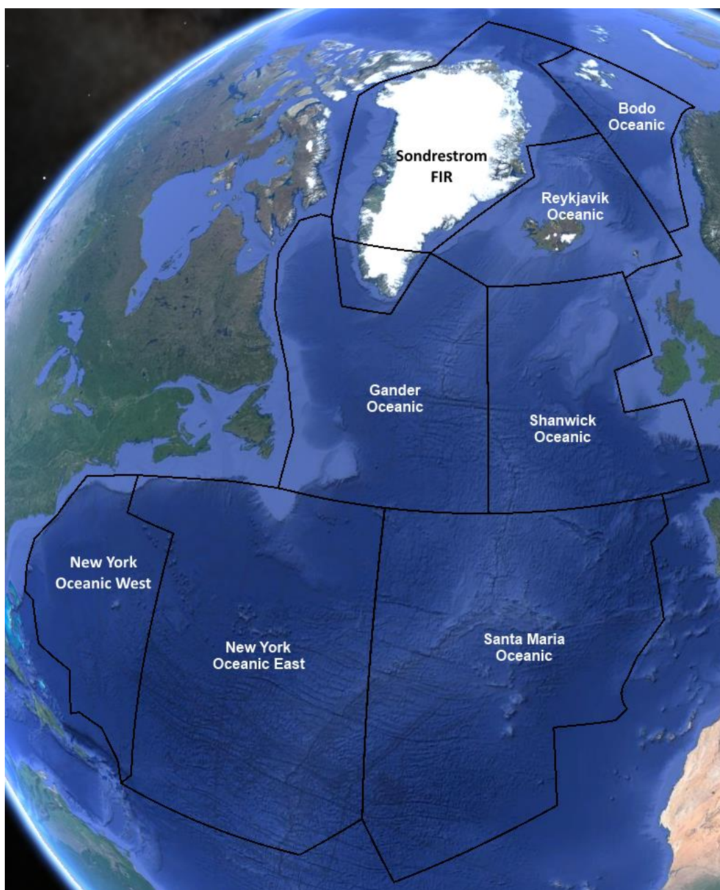
Figure 1 - North Atlantic Oceanic FIRs

Gander OACC at Gander provides air traffic control services in the Gander OCA with a collocated HF radio station.